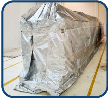
VCI / Aluminium Barrier Foil