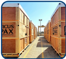
Extra Large Boxes