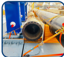
Lashing & Choking Materials