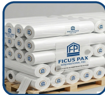
Heat Shrink Rolls