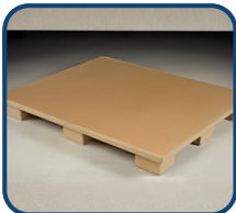
Paper Honeycomb Pallets